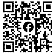
PTO Facebook Page