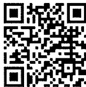
School Facebook Page

Please follow us on Facebook. Our Facebook page, Carolina Park Elementary, is the best way to stay informed. We will also use the automated phone call system and email for updates and announcements. This system pulls information from our database for the calls and emails. If you do not receive the messages please contact our main office to update your contact information.