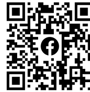
PTO Facebook Page