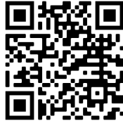
School Facebook Page

Please follow us on Facebook. Our Facebook page, Carolina Park Elementary, is the best way to stay informed. We will also use the automated phone call system and email for updates and announcements. This system pulls information from our database for the calls and emails. If you do not receive the messages please contact our main office to update your contact information. Please use this link or the QR code below to access our school's Facebook page.