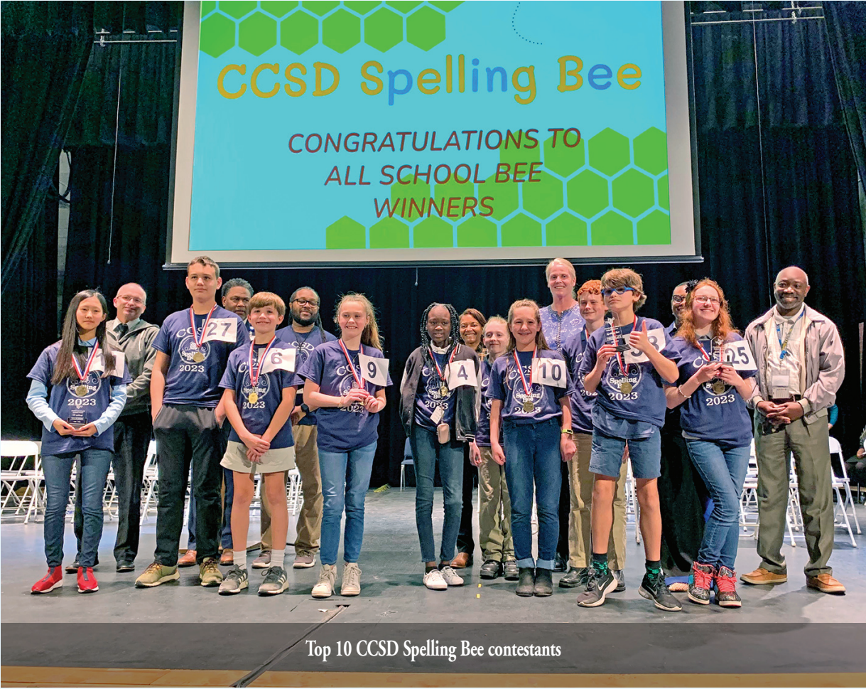
Top 10 CCSD Spelling Bee contestants