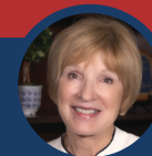
Gerrita Postlewait CCSD Superintendent

"We can only minimize the impact of this virus if we pay attention to the advice and guidance of the experts. While we all adjust our lives, our staff and community partners are working tirelessly to help ensure no child goes without food and instruction continues for all students."