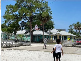
DOWN TIME AT TYBEE